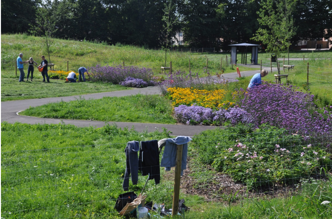
Grantham Green Growers in action!

We are still keen to recruit people who are interested in gardening for this project. If you are free on some Friday mornings, can get to the centre of Eastleigh and could enjoy, a little light gardening and some good conversation, call our office and leave your name and number.