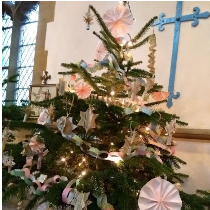
1950's Make do and mend Christmas Tree decorations

The Flagship Art Club members worked hard throughout November thinking about the "1950's Christmas" theme they had chosen. They used old sheet music books to supply material for the "Make do and mend" idea, making mouse ladders and linked paper chains. The result was beautiful! The trees in the festival were in the church over a weekend in early December for the public to admire.